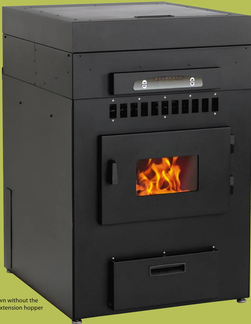
Shown without the optional extension hopper

Ugly Black Box (UBB) For Commercial and Residential Use